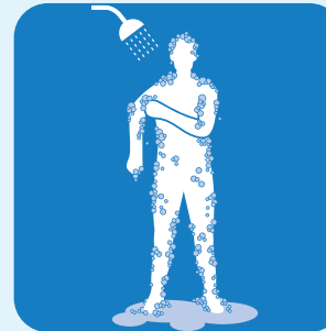
Wash Again Lavarse otra vez