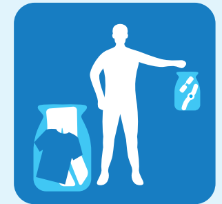
Remove All Sacarse todo