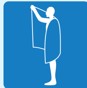
Cover Up Cúbrase