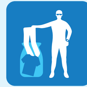
Remove All Sacarse todo