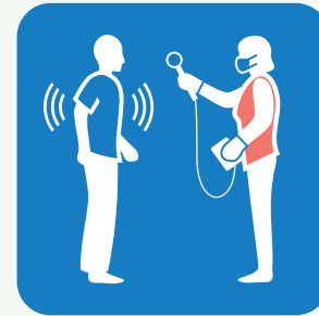
Handheld monitor Detector manual