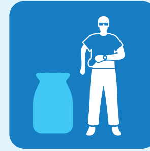
Remove All Sacarse todo