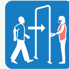
Portal monitor Pórtico detector